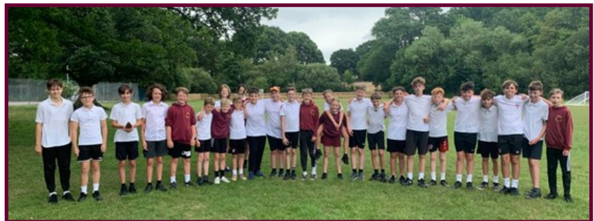
Year 7 and 8 Capture the Flag