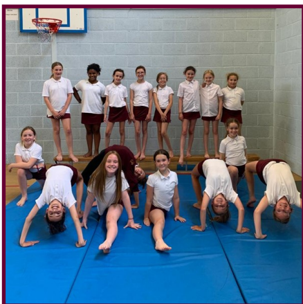
All year gymnastic reward

There have been numerous Epraise reward sessions this week with pupils spending their hard-earned candle credits - it has been great to see so many pupils enjoying themselves - when it's hard-earned it's all the more enjoyable!