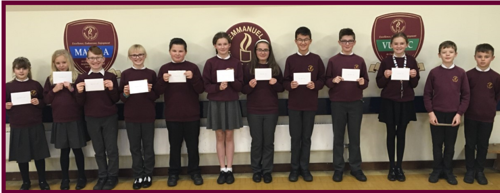
This term's voucher winners

Everyone in Grylls House was also awarded with a mufti day on Friday 20th December for being the house with the highest number of candle credits.