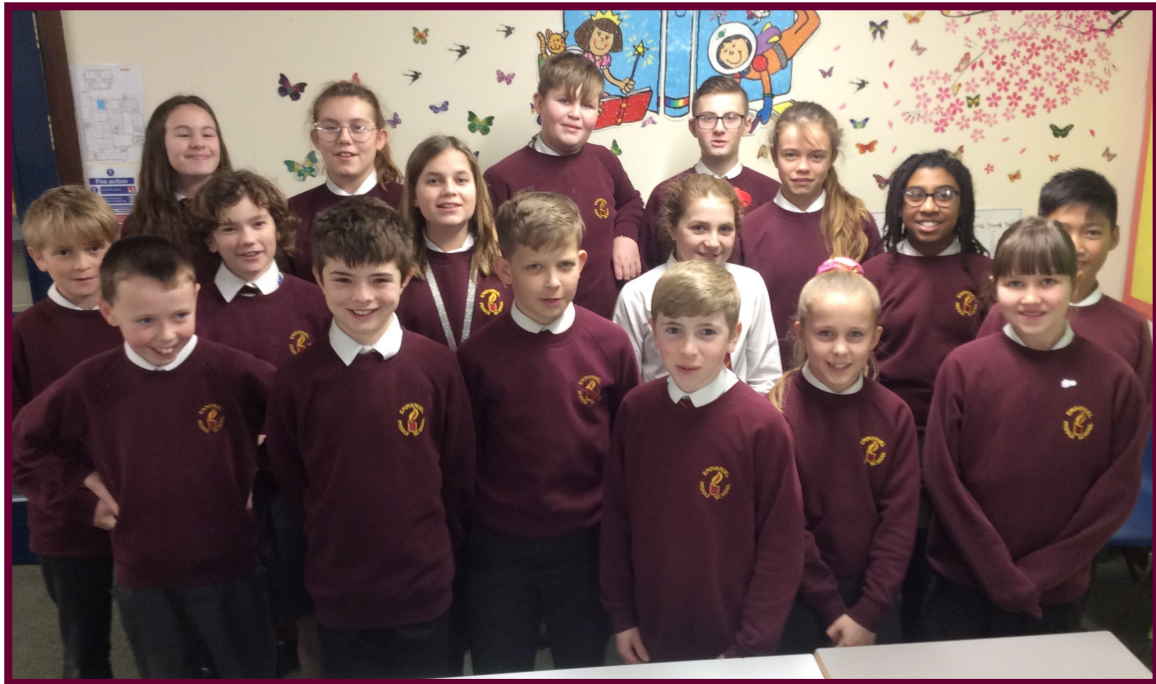
Winners preparing for their rewards afternoon