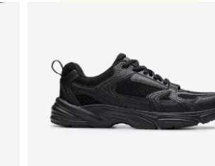
Crafton Move Youth