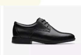
Jonwin Step Youth