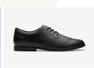
Finja Brogue Youth