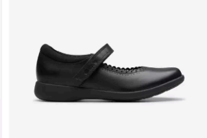
Etch Pure Kid