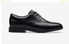
Jonwin Loop Youth