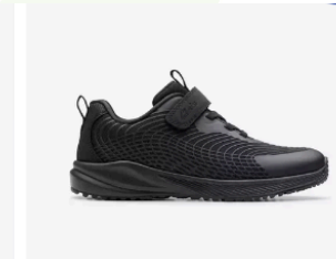
Deyes Dash Kid