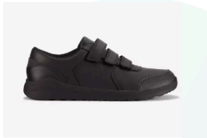
Daze Step 2 Youth