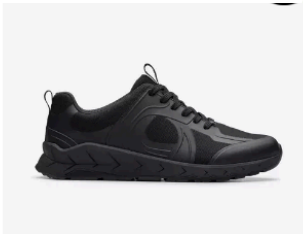
Selva Edge Youth