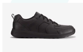
Daze Loop 2 Youth