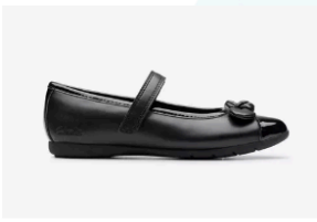
Dance Beam Kid