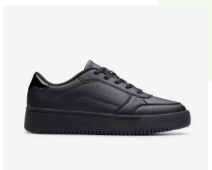
Barley Step Youth