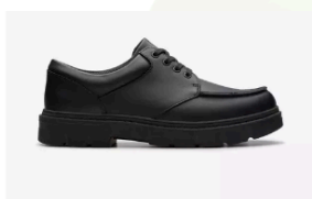
Lorcam Edge Youth