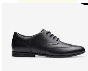
Finja Wing Youth