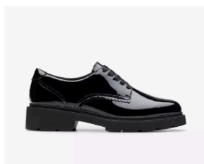
Eris Pure Youth