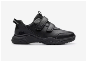
Feather Shine Kid