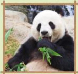
The Giant Panda Bear